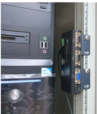
SK271B Mounted on a Rack